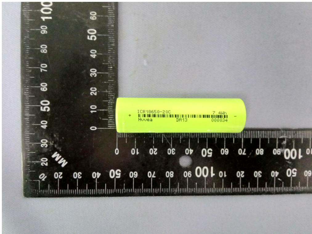
Figure 1 Overall view I of cell (外观图I)