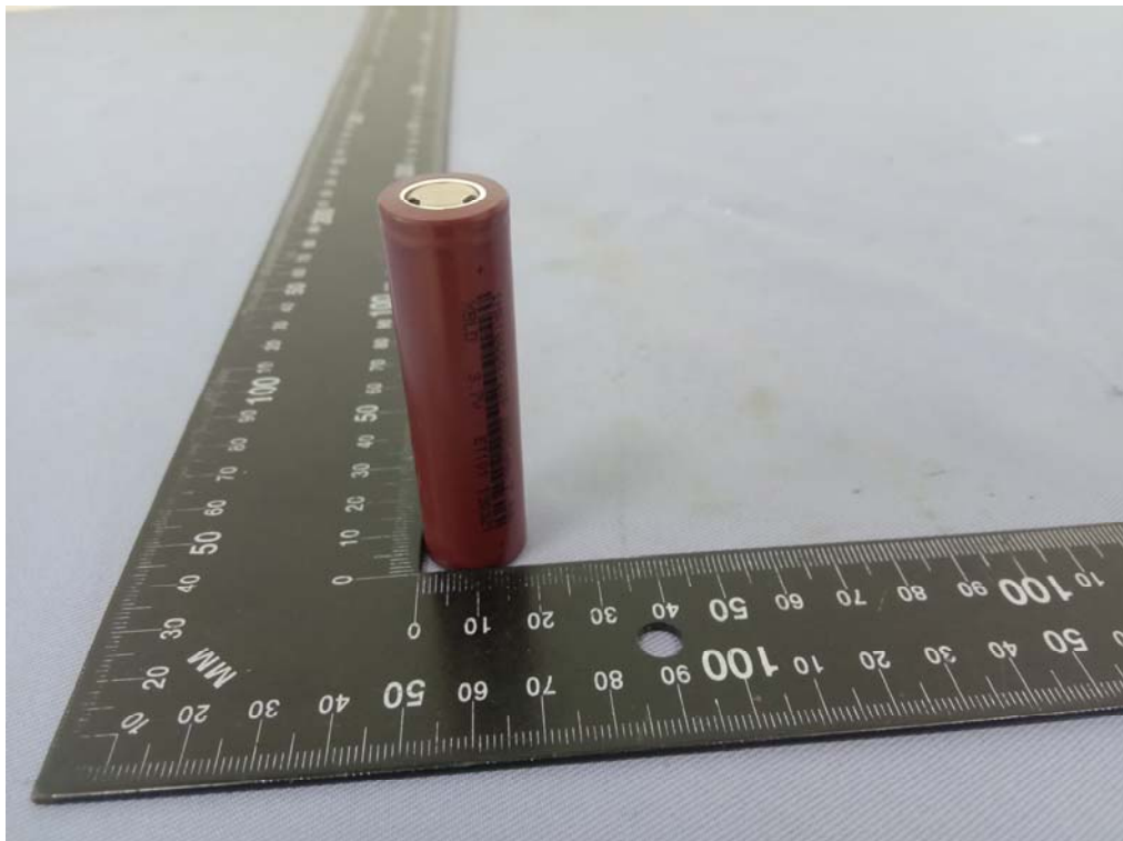
Figure 2 Overall view II of cell (外观图II)